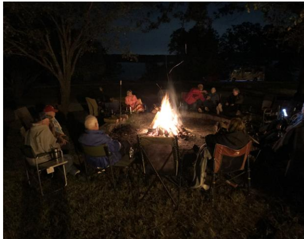
Around the Campfire @ Heyburn