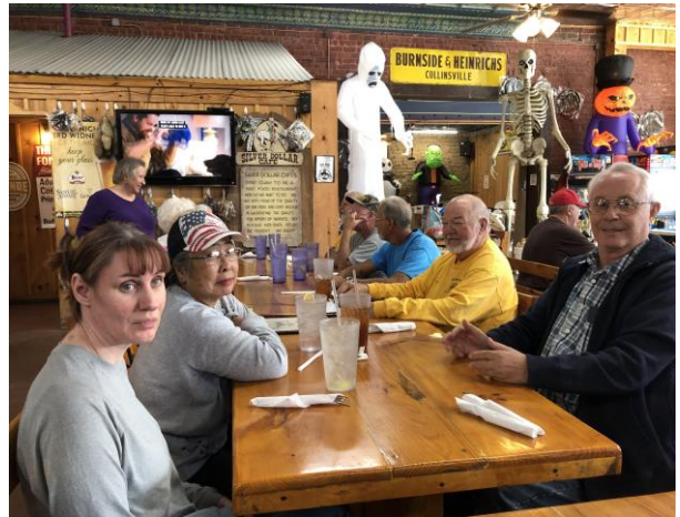
Decked out for Halloween @ Silver Dollar Cafe