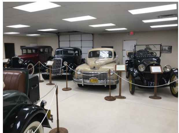
Fluorescent Rocks and Vintage Autos at DW Correll Museum